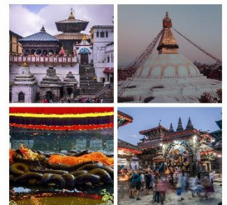
Boudhanath stupa and

Transfer to International airport for flight to Lhasa. Arrive Lhasa( 3600 meter), meet, assist and transfer to hotel. Rest of the day is free to acclimatize with the environment. Overnight stay at hotel.